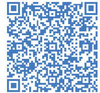
NIMHANS BRAIN MUSEUM