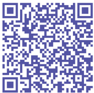
PLATINUM JUBILEE HALL