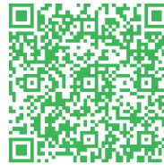
NIMHANS HERITAGE MUSEUM