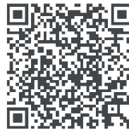
PSYCHIATRY SPECIALITY BLOCK (MOTHER & BABY UNIT)