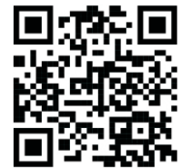
DEPARTMENT OF INTEGRATIVE MEDICINE