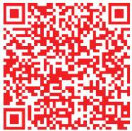
NIMHANS CONVENTION CENTRE (HALL A/B/C)