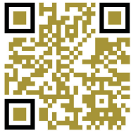
KRISHNA GUEST HOUSE