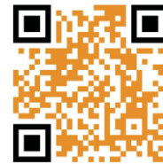
DR. MV GOVINDASWAMY CENTRE